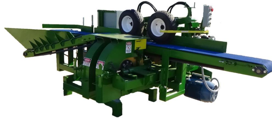
Double Head Electric With Return

Standard models can cut up to 8" wide. Can be custom built to fit your size requirements.