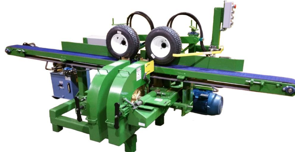
Double Head Electric Without Return