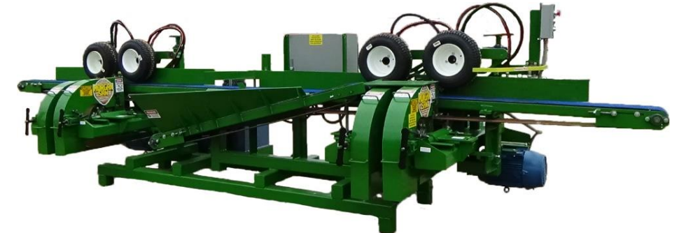
Four Head Electric With Return