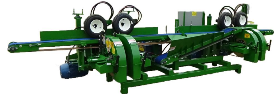
Four Head Electric With Return