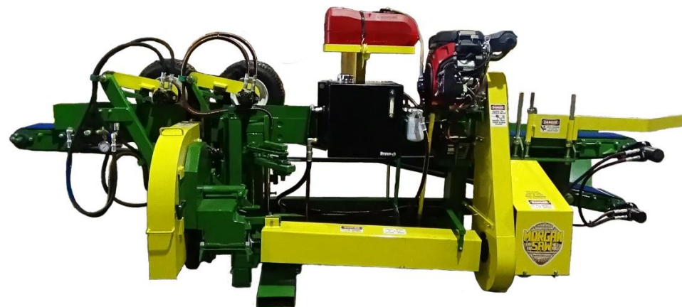
Single Head Gas With Return