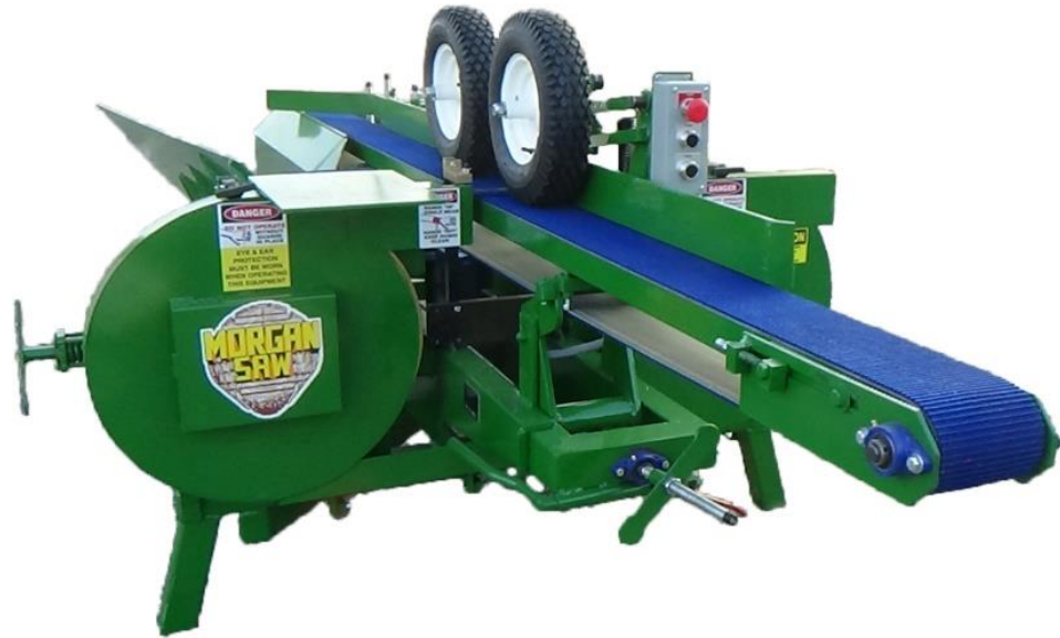
Single Head Electric With Return