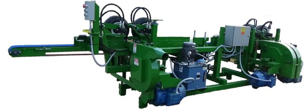
Three Head Electric With Return