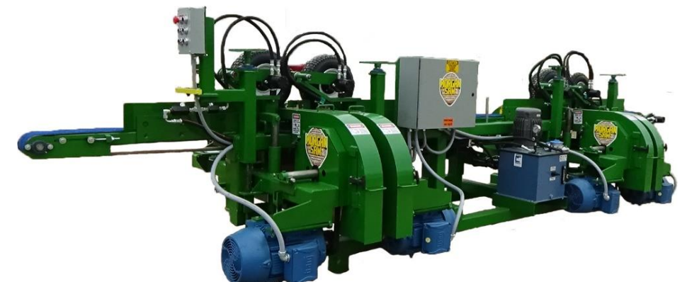
Four Head Electric With Return